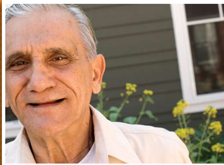
Lyons Gardens resident

One in five Travis County households is caring for elderly relatives.